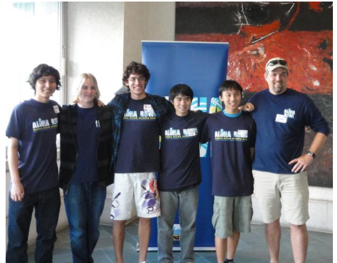
Winners of the 2011 Hawaii Ocean Science Bowl, Punahou School