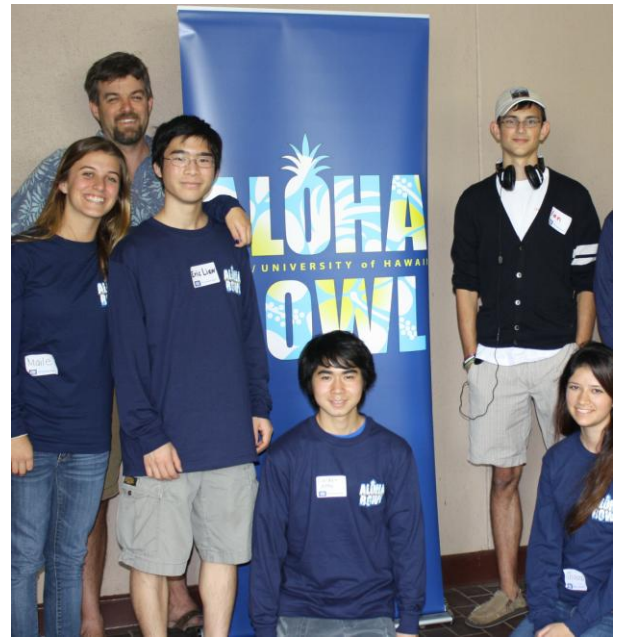
Winners of the 2010 Hawaii Ocean Science Bowl, Punahou School

During the competition, students were asked three types of questions: toss-up, bonus and team-challenge. Toss-up and bonus questions are in a multiple-choice or short-answer format. The team-challenge question is written out and handed to both teams at the half time of each round. These questions require higher cognitive skills, often use visual aids such as charts, maps, and graphs and the students work together to earn as many points as possible, which may make the difference between winning or losing the round of competition. Question difficulty increases as the competition progresses.