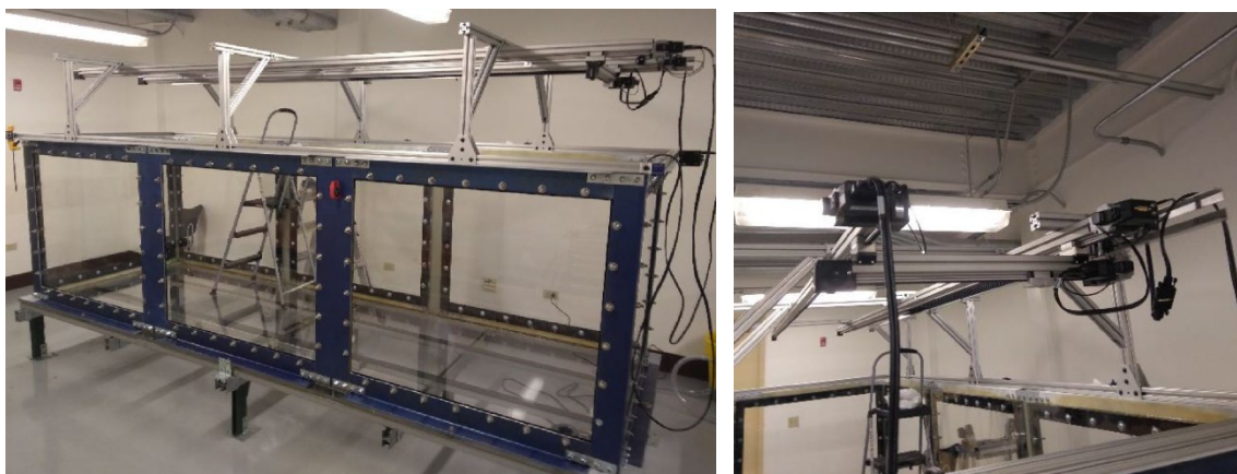
Figure 1. Multi-use testing tank installed at SUPR Lab. The tank has dynamic model positioning capabilities and allows for visual access from all sides for flow measurement/filming.

Both the Fluid-Structure Interaction and Nonlinear Dynamics Laboratory and the SUPR Lab are collocated at the UH Marine Center with shared physical space and facilities.