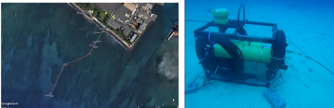
Figure 3. Kilo Nalu Observatory cable route (left) and acoustic Doppler current profiler (right).

The Kilo Nalu Observatory (KNO) on the south shore of Oahu provides a window into the nearshore coral reef physical, biological, and chemical environment. The permitted 7-acre in-ocean test range off Kewalo Basin, which extends from 5 to 20 meters depth with test platforms equipped with shore-cabled power and data connections, provides a direct bridge between lab-based and in-situ experiments (See Figure 3). The observatory is managed and maintained by ORE for research on marine alternative energy (a “nursery” site), autonomous undersea vehicle development (mobility and fine control, positioning, docking), artificial reefs, surface waves and currents, new sensors (e.g., pH and alkalinity) and more. A shore-side radar system provides wide area surface wave coverage. ORE also uses KNO as its “natural” laboratory to train its students, both (future) undergraduate and graduate, for ocean instrumentation, field work, data analysis, and team work.