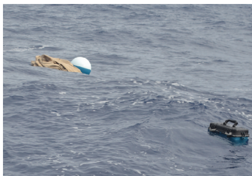
Drifting buoys deployed.

The expedition has successfully completed the survey of the probable pathways of tsunami debris moving toward the Northwest Hawaiian Islands. Among other tasks, 11 drifting buoys, designed to simulate the motion of different types of debris, were deployed in a line between Midway and the leading edge of the tsunami debris field. The data from these satellite-tracked drifters, used in conjunction with computer models, now allow the movement of the debris field to be monitored remotely, giving scientists and operational agencies a better awareness of the status of the debris field and of the region's current system.