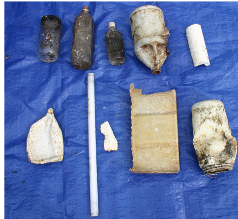
Isolated floating objects found during the expedition. They are probably not from the tsunami.

This survey has now been partly realized. The team organized end of November an expedition from Honolulu to Midway Atoll and beyond. Horizon Lines LLC shipped the equipment from California to Hawaii and Nobeltec provided navigational software for the expedition. The team had only the projections of a computer model to go on in search of the debris. The model, based on the trajectories of historical drifters, predicted at the outset of the expedition that the debris was heading toward Midway and Papahānaumokuākea Marine National Monument, arriving there as early as this winter. The model's trajectory had been confirmed end of September 2011 by the Russian Sail Training Ship Pallada , which reported the edge of the debris field 250 miles northwest of Midway, and picked up 100 miles further on, a 20-foot boat from Fukushima, which had been lost during the tsunami.