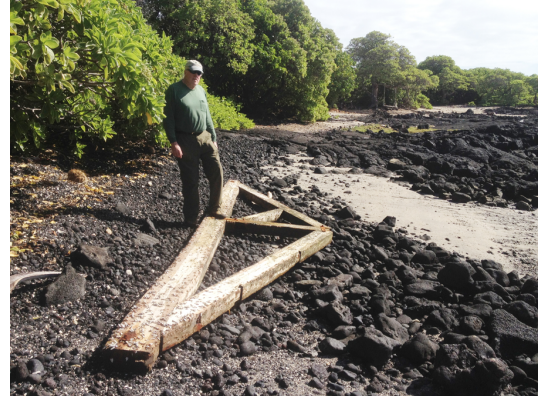
In Fall-Winter 2013, many wooden poles and beams with mortise and tenon features, such as this gabled roof end of small cabin with metal bracing holding all together and found at Kamilo Pt, started washing up on windward shores of Hawaiian Isles.