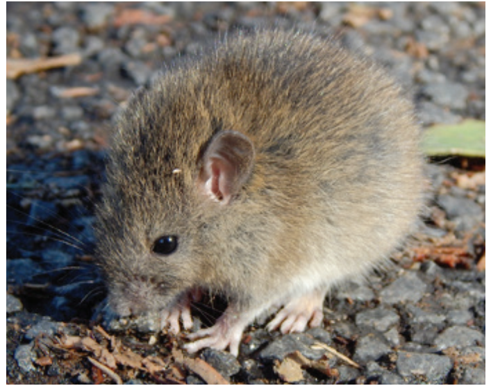
Ki'i 2: Ka 'iole Polenekia ma kahi ho'okū ka'a o ka Pāka Aupuni 'o Haleakalā, Maui.

Mahalo nui i nā luna mālama kumuwaiwai kūlohelohe he 24 ma Hawai'i nona ka hapanui o ka 'ike ma kēia palapala.