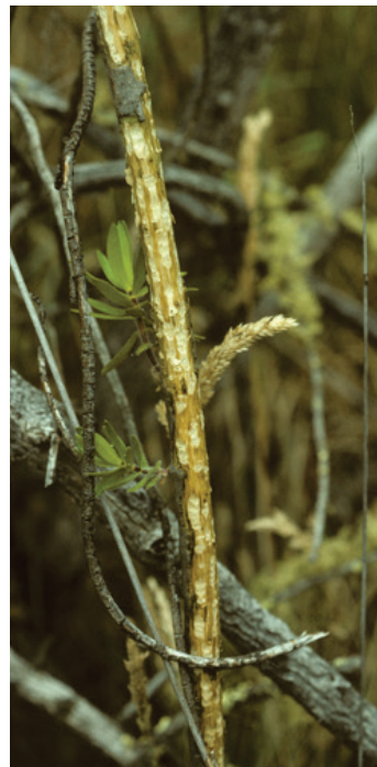
Ki'i 3: Pilikia ka 'ili lā'au o ka Dubautia arborea, he meakanu 'oiwi ma Hawai'i mukupuni.

“ I ka wā malo'o lō'ihī, 'ai ka 'iole i nā meakanu kāka'ikahi. Make wai lākou, no laila, nanali lākou i nā meakanu 'ane make. 'A'ole 'ono ia meakanu, akā, 'imi nā 'iole i ka wai.”