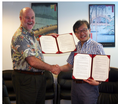
Deans of the University of Hawai'i at Mānoa and Tohoku University proudly display the signed agreement.

The new program, as envisioned, has two channels for institutional interaction: exchanges of students and short-term faculty visits. The first part of the agreement is designed for students obtaining a PhD degree at the Graduate School of Science at