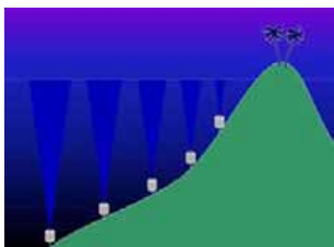
Bottom-mounted sonar was used to profile mesopelagic animals down to 500 feet. Graphic courtesy Benoit-Bird

Equipment included: echosounders operating at 200 kHz, modified to be controlled remotely with a small computer; a remote controlled digital camera for still